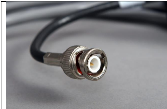
Tango M2 ECG Connection BNC male