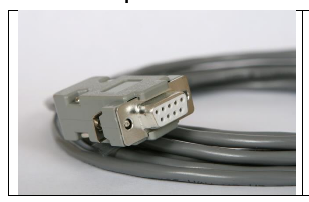
Tango M2 Connection 9 pin female