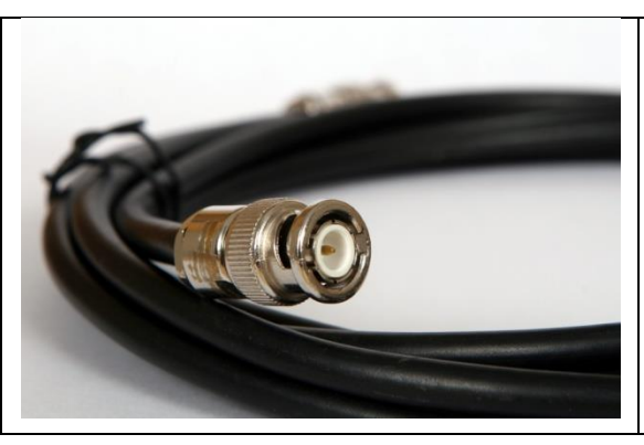
Tango M2 Connection BNC male