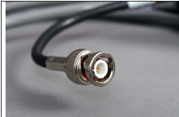
Tango+ ECG Connection BNC male