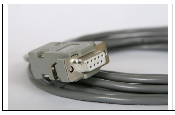
Tango M2 Connection 9 pin female