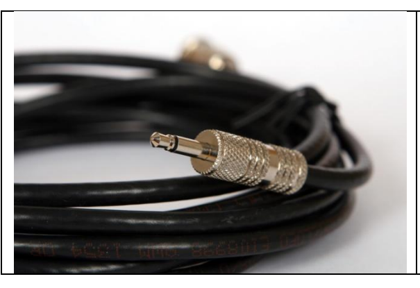
Tango M2 Connection BNC male