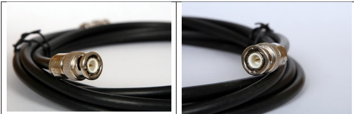
Tango M2 Connection BNC male