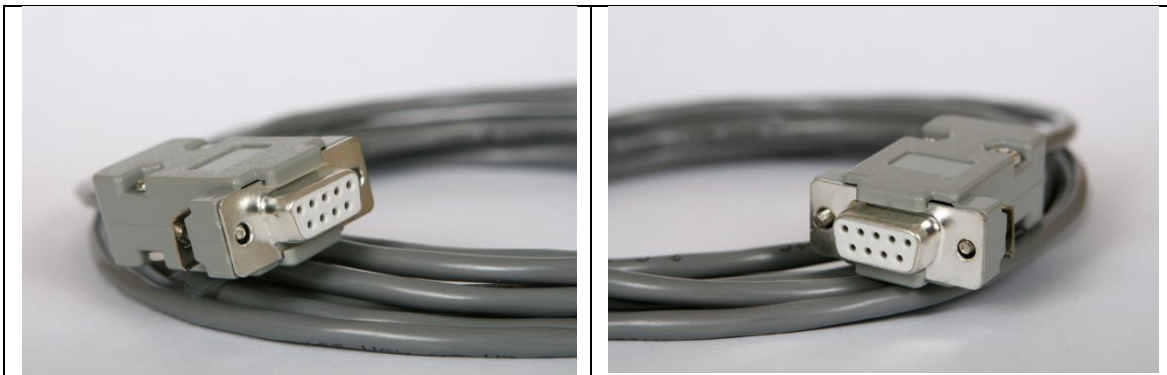
Tango M2 Connection 9 pin female