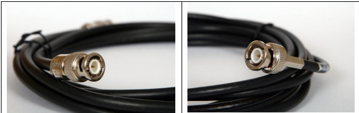
Tango M2 Connection BNC male