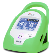
Tree Frog Green