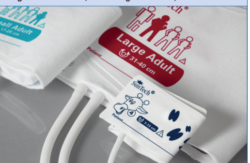
One or Two-Tube Designs Available