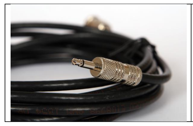
Tango M2 Connection BNC male