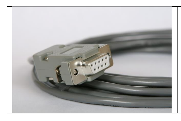
Tango M2 Connection 9 pin female