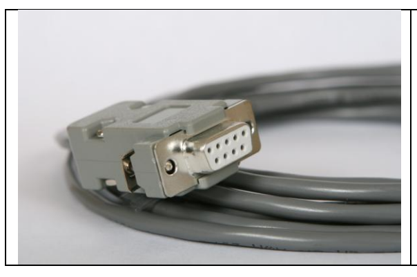
Tango M2 Connection 9 pin female