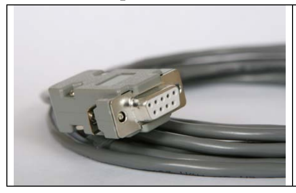
Tango+ Connection 9 pin female