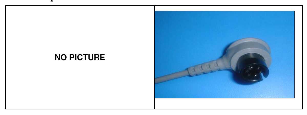
Tango+ Connection AAMI connector